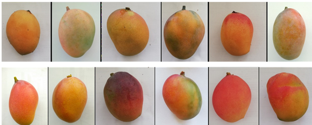
Figure 1. Mango fruits of 12 cultivars at the ready-to-eat stage, cultivated in Western Crete, Greece

Results are the means of a two-year period