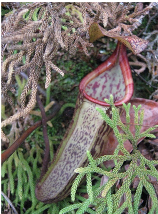
Figure 1. Nepenthes macfarlanei at the Genting Highlands, Malaysia

Three plants of Nepenthes macfarlanei (Figure 1) were sampled from around the summit of Gunung Ulu Kali (the Telecom Tower) in February 2011. A single leaf (all leaves were estimated to be less than one year old) was collected from each plant, dried in a forced air oven and stored dry until analysis.