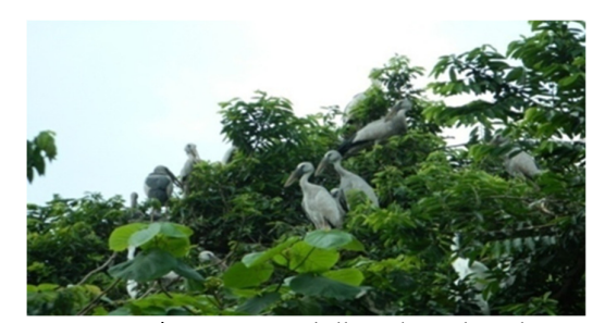
Figure 4. Asian open bill stork's colonial nest

birds, thus incurring a financial loss. Due to heavy rains, chicks may sometimes fall from their nests and are rescued by the villagers and returned to their original nests. Small children are also forbidden from setting off firecrackers near the trees during the nesting season. Similar heronry protection has been observed in some villages of Uttar Pradesh, Andhra Pradesh and Tamil Nadu (Pathak, 2009). Such an approach helps to increase the population by decreasing the mortality rate.