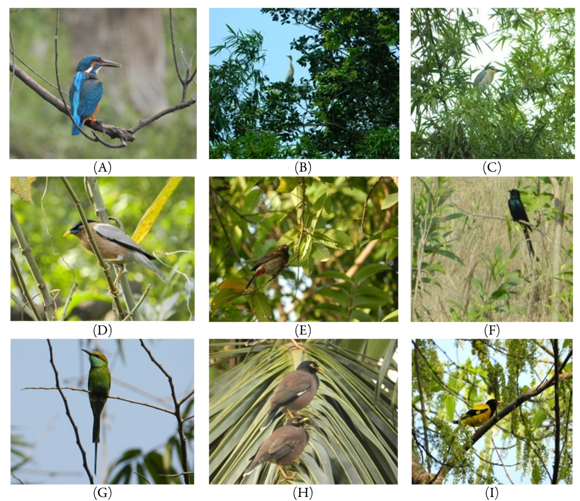
Figure 5. Bird diversity in the study area (A) Alcedo atthis (B) Bubulcus ibis (C) Nycticorax nycticorax (D) Sturnia pagodarum (E) Pycnonotus cafer (F) Dicrurus macrocec (G) Merops oviertails (H) Acridotheres tristis (I) Oriolus xanthornus