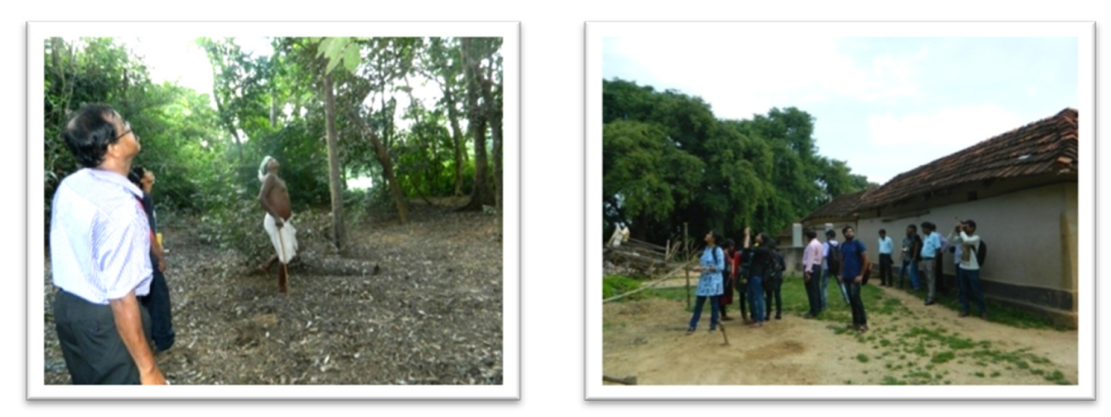
Figure 3. Data collection from tribal people of Barachaka Village, Bankura, West Bengal, India