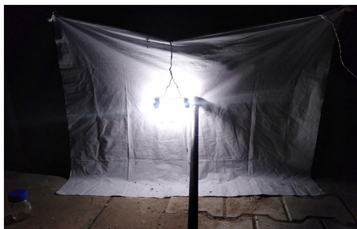
Figure 2. Light sheet used for collection of moths