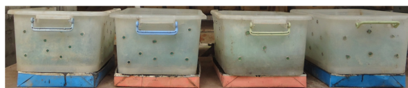
Fig. 3. Plastic boxes used for production of maggots