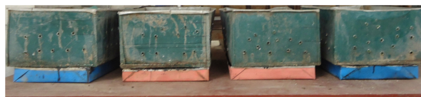
Fig. 2. Aluminium boxes used for production of maggots