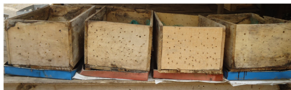
Fig. 4. Wooden boxes used for production of maggots