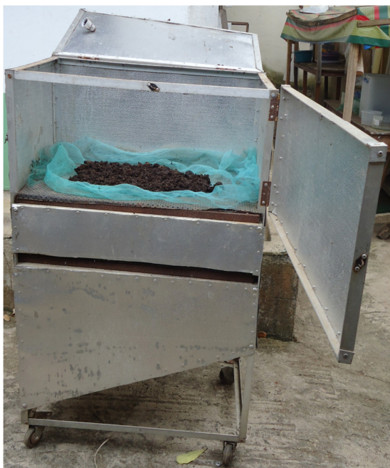
Fig. 1. Aluminium mobile maggotry used for production of maggots

The aluminium boxes that were used for the maggot production each measured 0.2 \times 0.33 \times 0.5 m; plastic boxes measured 0.5 \times 0.35 \times 0.22 m and the wooden boxes each measured 0.6 \times 0.5 \times 0.3 m (Figs. 2, 3, 4). The boxes were perforated on all sides with open top. The side perforations were to allow adequate aeration, while the perforations underneath the boxes were to allow dropping of maggots. A tray painted black was put under each box to allow for easy collection of maggots. The bottom of the boxes was lined inside with mosquito nettings to reduce the amount of dung dropping with the maggot. All the culture boxes were placed on a constructed long wooden table.